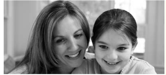
Someone like Amber wants a health insurance plan that provides her family a wider range of benefits. She may prefer the lower deductibles and lower out-of-pocket costs of Personal Select.