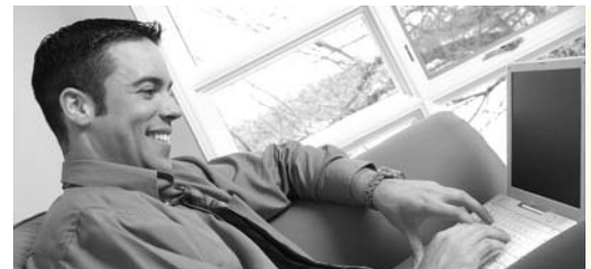
Someone like Peter is looking for a plan where he doesn't have to pay for benefits he may not use. He would still like coverage should he be in an accident or is affected by a medical condition. Peter may find the benefits with Personal Benefit (HDHP) a good fit for his health insurance needs.