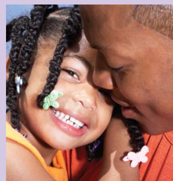
Welcome to Health Net Life Insurance Company (Health Net).

Whatever you're looking for in a health insurance plan – affordability, broad benefit coverage, choice in doctors, or wellness programs to keep you and your family healthy – you'll find it here.